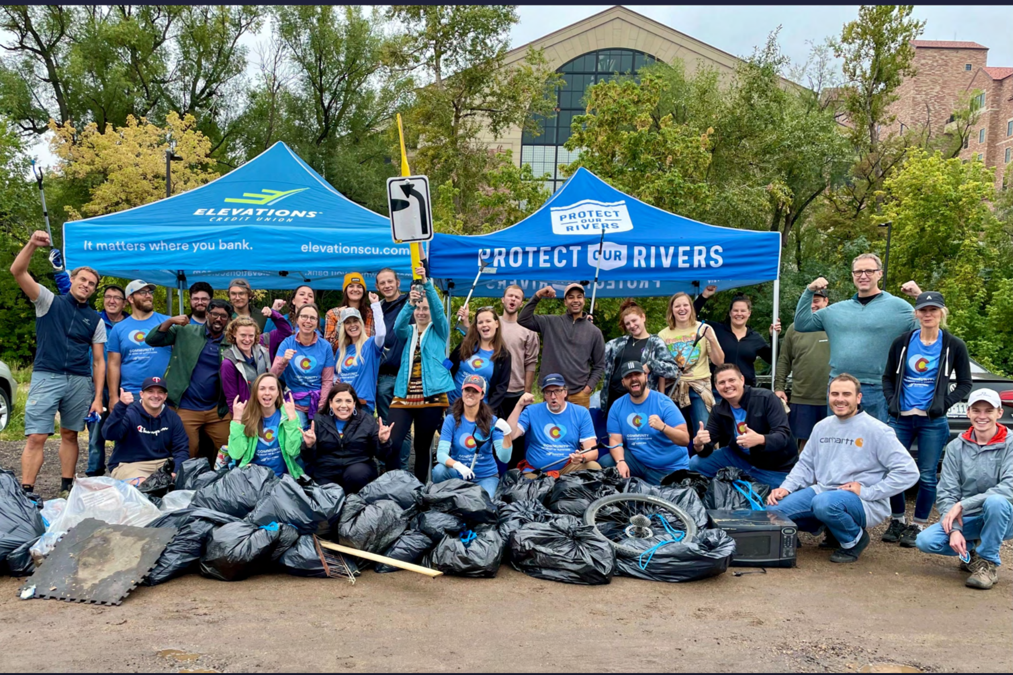
Boulder Creek Cleanup organized by Protect Our Rivers With Elevations, Ayva, and Community Volunteers (9/22/22)

Have other technological needs? Ayva's primary business is in ethical IT reform, Information Security, and solving all kinds of hard technological problems. Feel free to reach out to us if you know of a company that could use our services.